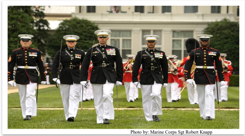
Washington,, D.C.- July 11, 2019

Marines march across the parade deck for pass in review during a passage of command ceremony at Marine Barracks Washington, D.C., July 11, 2019.